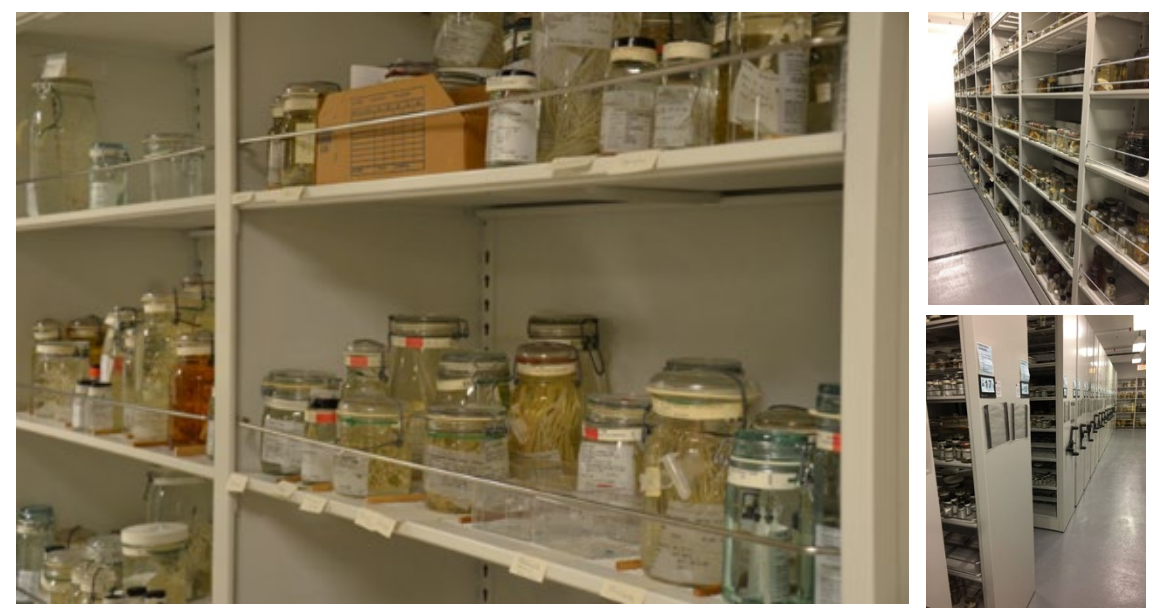
Wet Collections in Glass Jars; Metal Shelving with Containment Rails. (Smithsonian Institution)