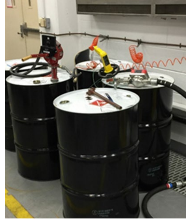
Smithsonian Institution's Museum Support Center: Bulk ethanol drums in a separate, 3-hour rated, flammable liquids storage room.

A hazard analysis along with a fire safety management plan should include consideration for drainage and/or containment to prevent the flow of ignitable liquid into adjacent areas of the facility that are not protected for an ignitable liquid fire hazard.