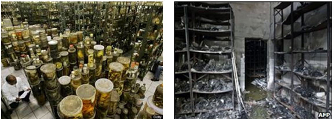
Wet Collection Fire (Before and After), Butantan Institute, San Paulo, Brazil, May 2010

Apart from the type of fire hazard that can be created, it does not take a lot of ignitable liquid storage to create an unacceptably large fire in a general-purpose warehouse. Full-scale fire tests have shown that even a relatively small quantity of ignitable liquid can quickly overwhelm a sprinkler system designed for general storage."